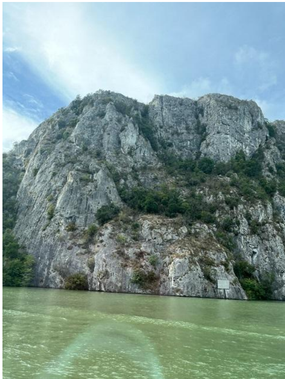
Coast of Serbia

An 11 day cruise on the lower Danube took us into 5 countries. We traveled through Hungary, Croatia, Serbia, Bulgaria and Romania!